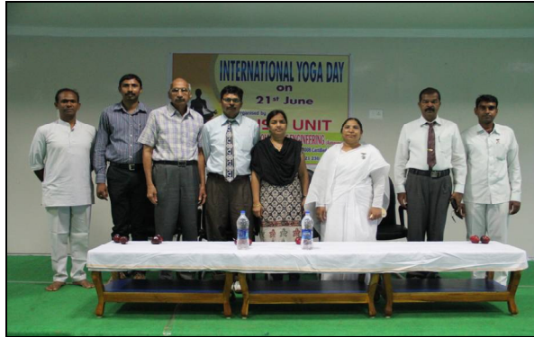
Team of Brahmakumaris