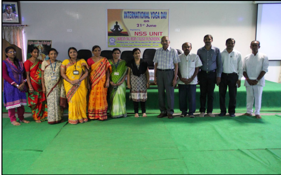
Team of Rama Chandra Mission