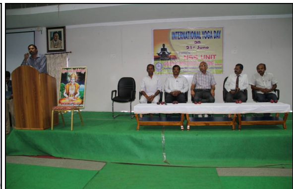
Inviting guests into the stage