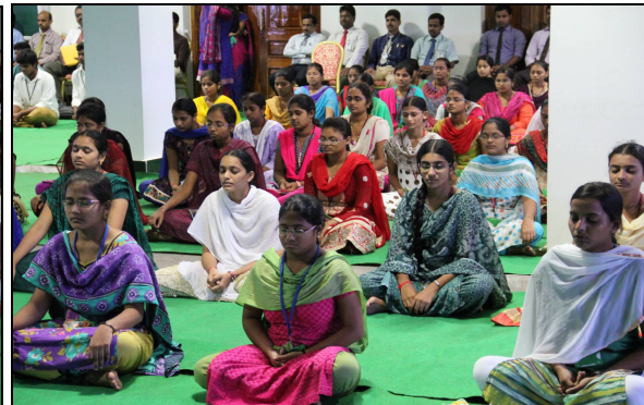
Students during yoga sessions