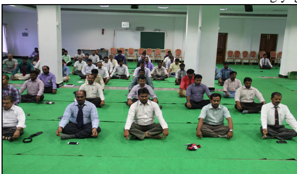
Faculty making the yogasanas