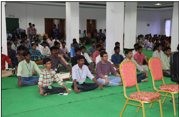
Students during yoga sessions